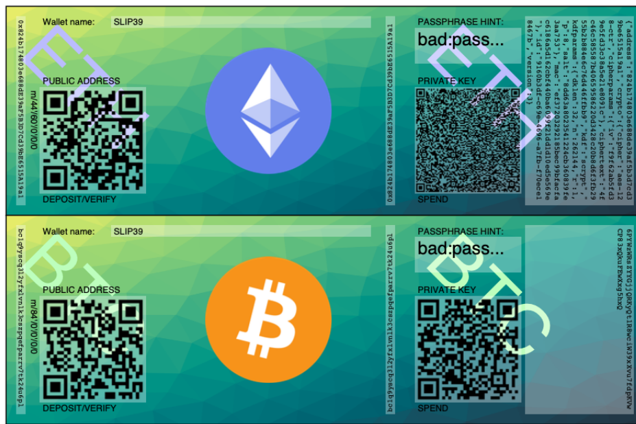
Figure 2: Paper Wallets (from --secret ffff... )

To recover your real SLIP-39 Seed Entropy and print wallets, use the SLIP-39 App's "Recover" Controls, or to do so on the command-line, use slip39-recovery :